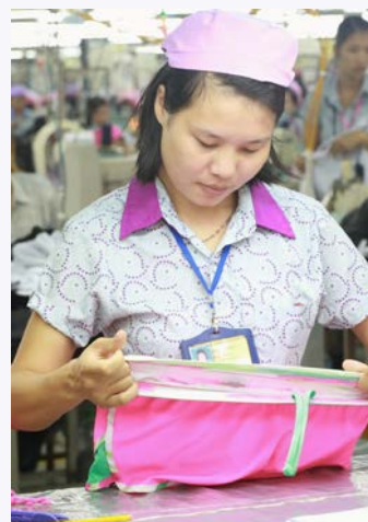
Garment Factory Worker in Vietnam.